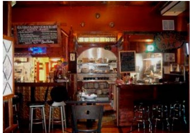
Open View from Into Kitchen